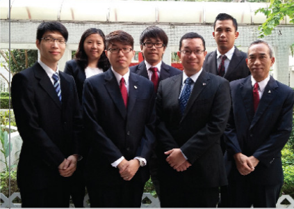
港島團 HKI Team